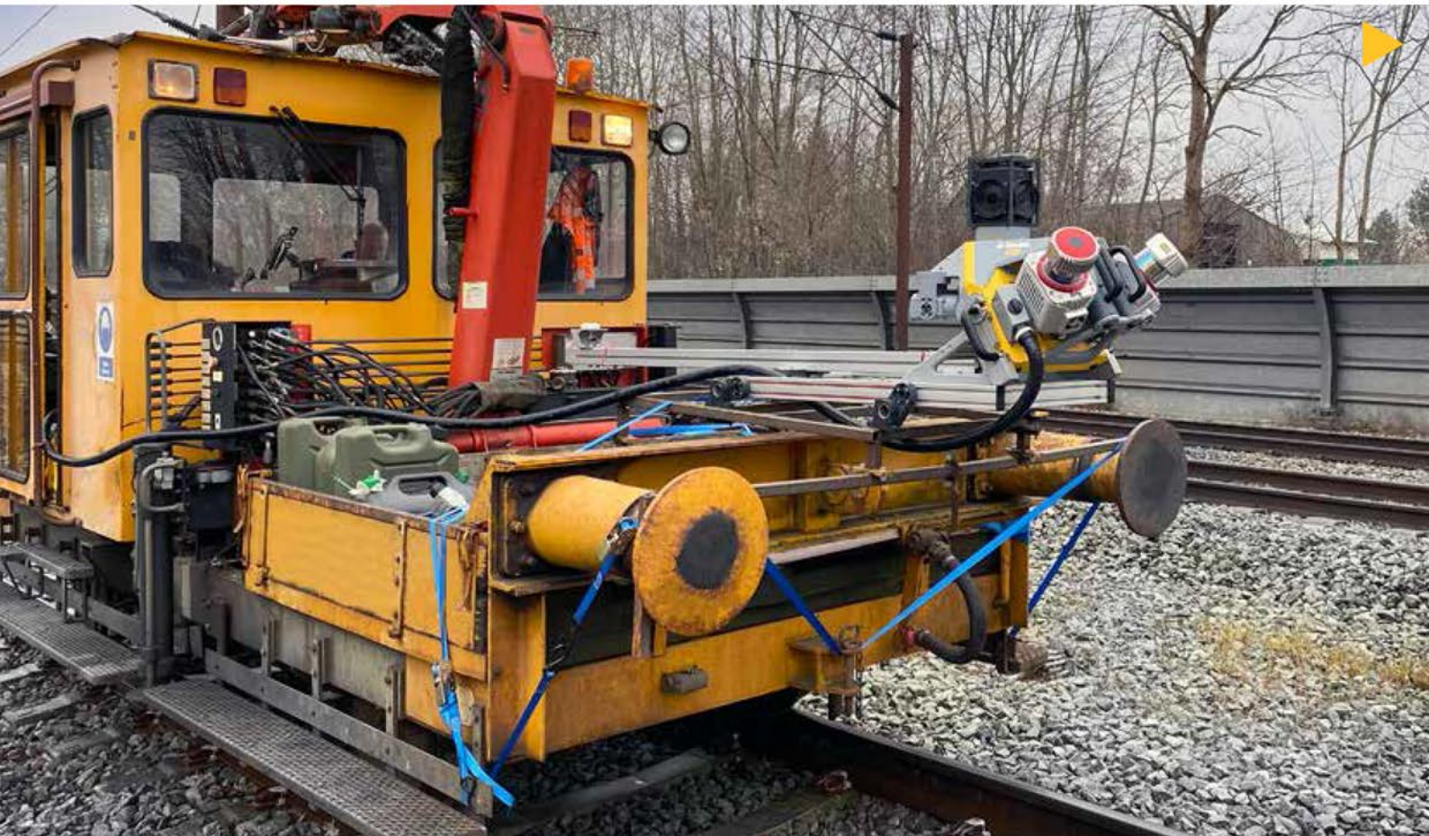
LE34 mounted the MX9 on a rail maintenance lorry for the railway mapping project. The system is controlled by a tablet computer in the lorry cabin.