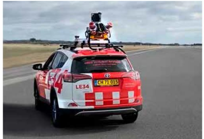
The mobile mapping system is relatively light for such instrument packages, and LE34 has adapted it for mounting on autos for roadway surveys.

combined with PPK (post-processed kinematic) GNSS by adjusting various parameters in the Applanix POSPac office software. It paid off. "We were very happy to see our results at 7mm," said Møller.