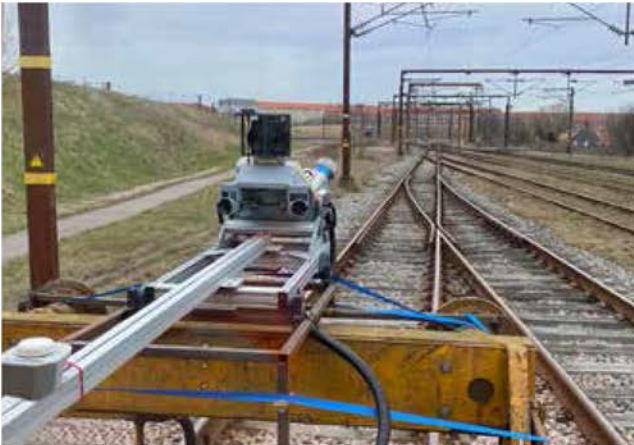
The mobile mapping system was mounted on the front of a rail maintenance lorry. LE34's tests determined to optimal speed for this mapping project, a function of survey control target spacing, and desired point density, was 45 to 50km per hour.